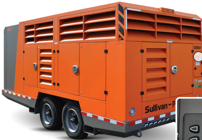
Sullivan-Palatek Electronic Controller (SPEC)